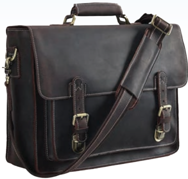
Polare Men's Full Grain Leather Laptop Briefcase Messenger Bag