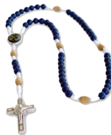
Handmade in Germany