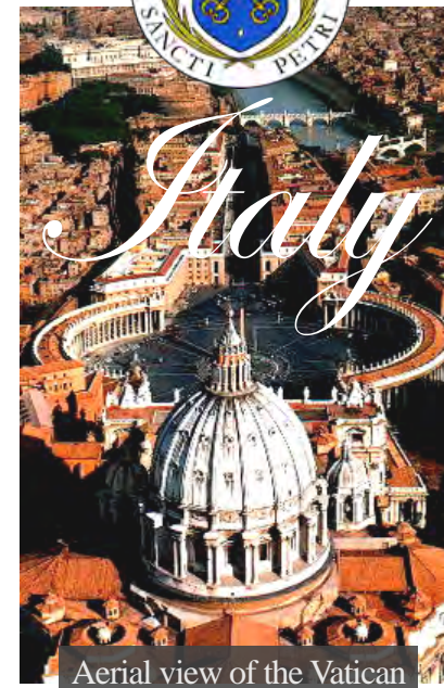
Aerial view of the Vatican

Travel to Rome, Italy to attend a Solemn Mass of Thanksgiving at the Fraternity of St. Peter's Rome Parish on the 25th anniversary of the order's founding. See the most important religious sites of the Eternal City and then travel south to visit the shrines of Pompei, Nettuno Materdomini, Naples & Amalfi.